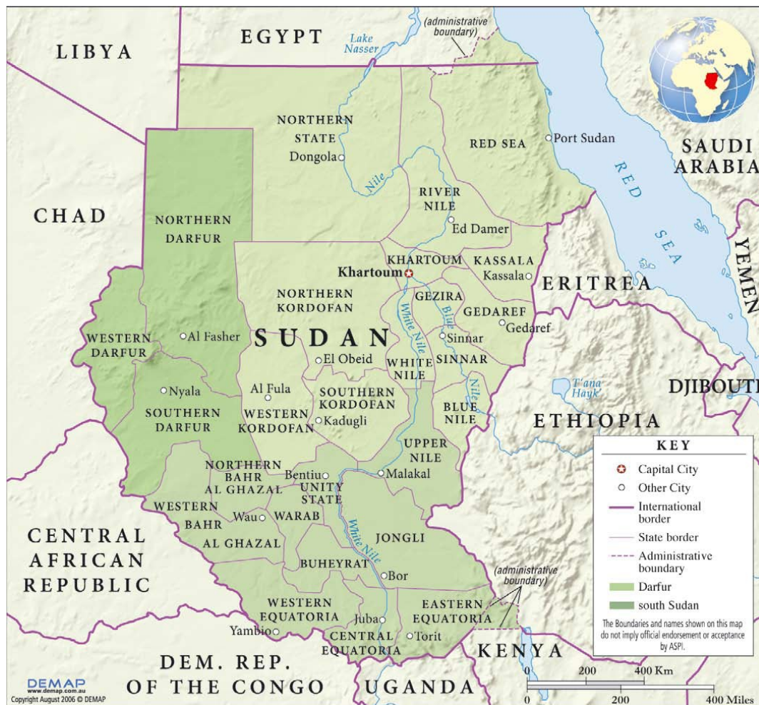
Diagram 1 – Map of Regions of Sudan 6

Since that time, Darfur has suffered neglect and marginalization by successive governments. Britain's main interest in Darfur was keeping the peace and to achieve this, deliberately divided the region and its inhabitants. This was even reflected in the education system, where schooling was restricted to a few, to minimise a challenge to their authority by an educated group. 7 This regional neglect also extended to health, infrastructure and the local economy.