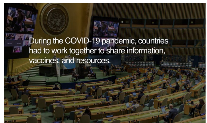
During the COVID-19 pandemic, countries had to work together to share information, vaccines, and resources.

The videos can be viewed on the POTI YouTube channel .