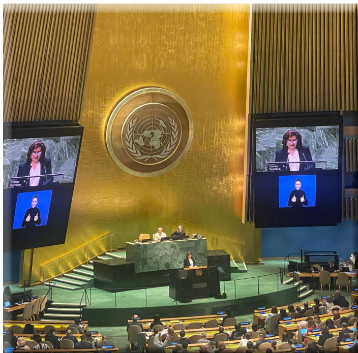
UN-Women Executive Director Ms. Sima Sami Bahous during the CSW68 General Assembly: "Women bear the brunt of conflicts they did not start".

I was promoted to a sergeant (1) rank, which is such a big milestone to me. I hope to do my master's degree in criminology soon.