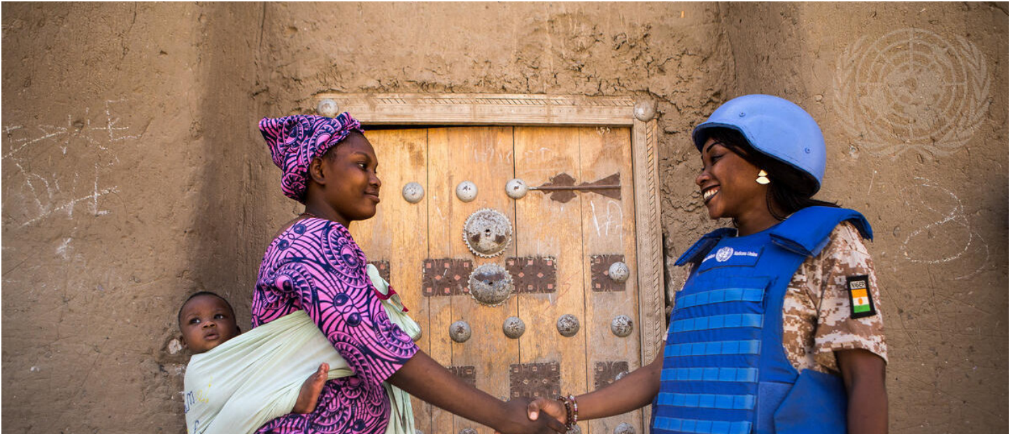
Cover photo for United Nations Specialised Training Materials on United Nations Police.

The Institute released a new course, two translations, and an audiobook in the first few months of 2024. Sourced directly from the United Nations Peacekeeping Resource Hub under a revocable license issued by the Integrated Training Service, United Nations Specialised Training Materials on United Nations Police is aimed at providing a training package that prepares officers for duties on United Nations peace operations, including strategic guidance, United Nations policing concepts, protection of civilians, and human rights.