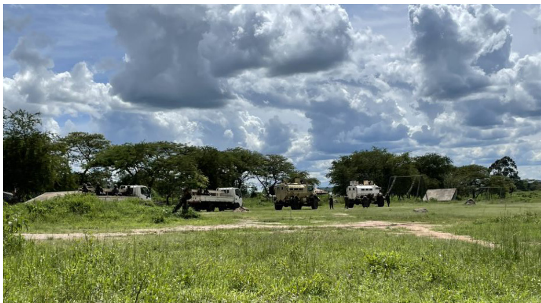
Peace Support Operations Training Centre (PSO-TC) in Singo, Uganda. 2 May 2022.

Letter from the Executive Director, p. 4