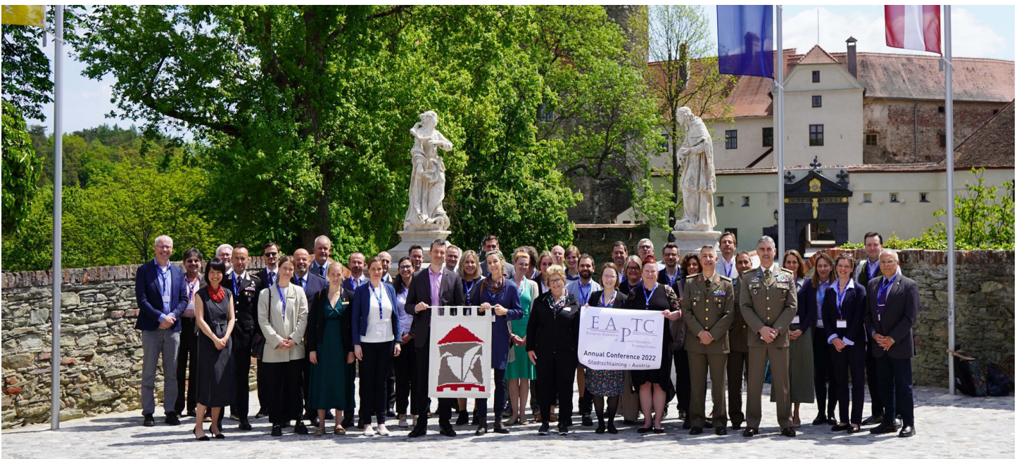
Group photo of participants at the 2022 EAPTC Conference in Stadtschlaining, Austria. 12 May 2022.

In total, 25 organizations were represented, and 38 individuals attended the conference. POTI was honoured to meet with various training officers, researchers, commandants/directors, advisors, and other military, police, and centre representatives. POTI looks forward to continuing to foster these relationships as the Institute works towards the common goal of providing training on peace support to those in the field. POTI is grateful for the opportunity to attend EAPTC and similar conferences, which gives the Institute the chance to discuss these topics and the ever-changing needs of peace operations personnel.