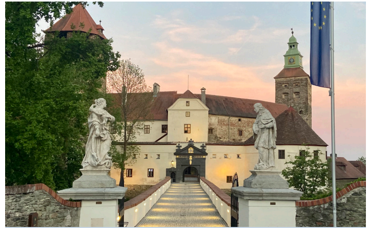
The medieval Peace Castle was the venue for this year's EAPTC Conference, hosted by ASPR. 10 May 2022.

The conference consisted of multiple educational sessions on topics such as environmental challenges and their impact on peace operations, PeaceTech, knowledge management, the implications of the conflict in Ukraine, and lessons from Afghanistan. Each session was interactive and allowed participants to discuss these topics from varying perspectives and how they relate to their organizations’ work. The sessions on the environment and technology were of particular interest to POTI, as the Institute is working to develop courses on how these topics intersect with peacekeeping. On the last day of the conference, a Marketplace Bazaar was held to allow participants to learn more about one another’s ongoing projects and ideas. This gave POTI the opportunity to share its