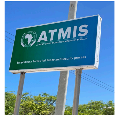
ATMIS sign outside Mogadishu. 13 May 2022.

In 2021, more than 380 students from ATMIS completed courses with POTI, and POTI met the demand for over 2,200 enrolments. In 2022, POTI has met the demand for over 1,000 enrolments from ATMIS personnel. The most popular course for ATMIS students this year has been An Introduction to the UN System and Its Role in International Peace and Security . POTI looks forward to continuing to serve students from ATMIS.