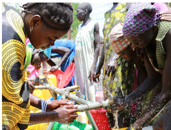
Women at a water point at protection of civilians site 1 in Juba, South Sudan. 8 May 2018.

Building the civilian capacities of missions will continue to be a key goal for stakeholders in peace operations in the years to come, as civilians play increasingly vital roles in missions. Not only do civilian staff perform tasks related to peace operation mandates, but they also serve as the logistical backbone of administrative functions, such as finance. POTI is honoured to serve this population.