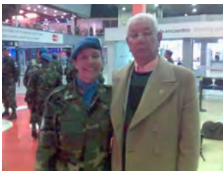
“Buenos Aires airport with my father saying goodbye.”