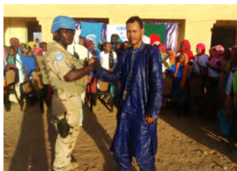
“Activities of Civil Affairs, MINUSMA”.