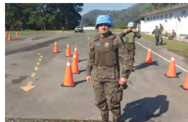
“Driving Test, this was not an easy test but with some practice it was passed.”