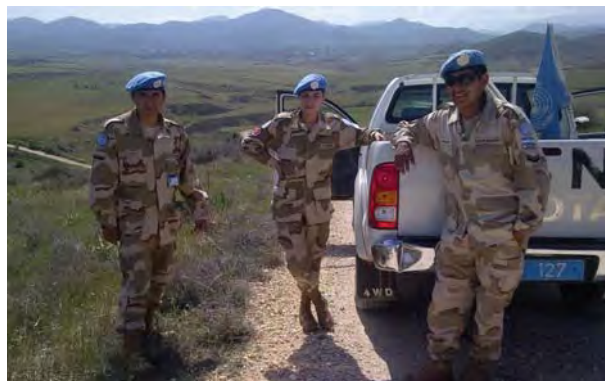
"Mision de paz, Chipre". Submitted by Mm. Cabral, Argentina.

With students from diverse geographic and cultural backgrounds, we do our best to make each course available in a number of languages. When students take a course in English or French, they are also practicing their proficiency in the languages used officially by UN peacekeeping operations.