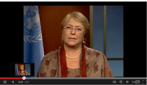
UN Under-Secretary-General Michelle Bachelet, Executive Director of UN Women, during her remarks to POTI students.

The Peace Operations Training Institute and UN Women are pleased to report the continued expansion of their ongoing collaboration in the worldwide delivery of e-learning on the implementation of UN Security Council Resolution 1325 (2000) and the empowerment of women. UN Under-Secretary-General Michelle Bachelet, Executive Director of UN Women, personally greets each new student with a recorded video that welcomes students and introduces the courses Implementation of SCR 1325 (2000) in Africa and Implementation of SCR 1325