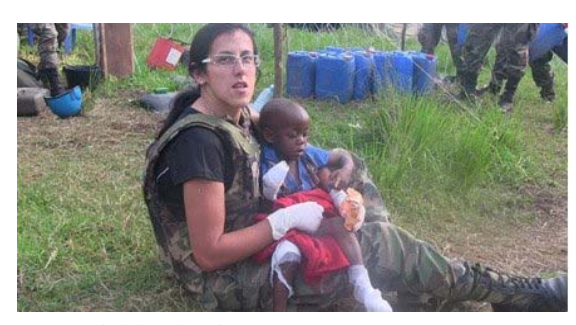
Join the 4,500+ POTI facebook group members and connect with fellow peacekeepers at:

"MONUSCO troops protecting the populations from attack by Mai Mai militia."