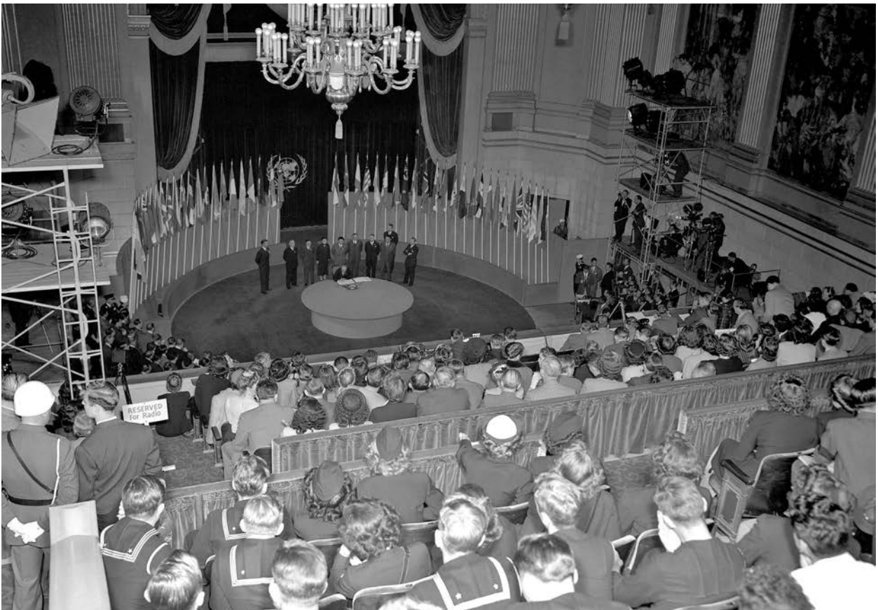
Members of the delegation from China at the signing of the United Nations Charter: Dr. V. Wellington Koo, of China, signed on behalf of his government. 26 June 1945.

The lesson includes information on the strategic decision-making bodies of the United Nations, including the Security Council, which issues the peacekeeping mandates that guide peacekeepers' duties in the field. The departments that operationalize the Security Council mandates are also discussed in some detail, including how they relate to UN policing.