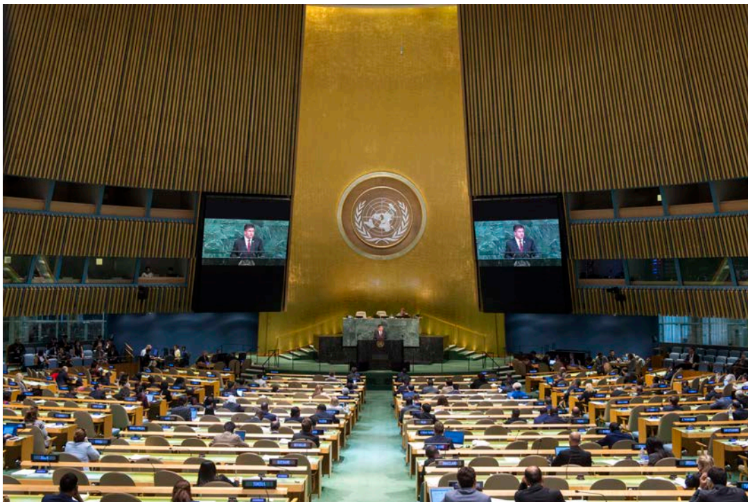
Miroslav Lajčák, President of the seventy-second session of the General Assembly, speaks at the conclusion of the Assembly's annual general debate on 25 September 2017.

The General Assembly monitors the performance of UN Peacekeeping and provides direction to the Secretariat through the Special Committee on Peacekeeping Operations. Delegates who make up this committee usually come from the military, police, or diplomatic services of Member States. 10