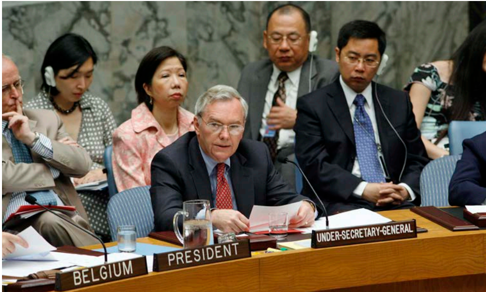
B. Lynn Pascoe, Under-Secretary-General for Political Affairs, addresses the Security Council meeting on the maintenance of international peace and security, at UN Headquarters in New York. 25 June 2007.