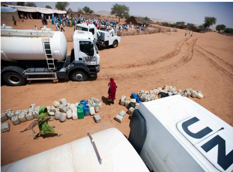
Water is distributed in El Srief (North Darfur) where the nearest water point is 15 kilometres away. The activity fosters DDR. The outreach activity is organized by the African Union-United Nations Hybrid Operation in Darfur (UNAMID) and supported by the United Nations Development Programme (UNDP), the United Nations Children's Emergency Fund (UNICEF), the North Sudan DDR Commission, and the local NGO Friends of Peace and Development Organization (FPDO). 25 July 2011.

The post-conflict environment also offers opportunities. One of these opportunities is to reform the political system and change features that potentially contributed to the outbreak of violent conflict in the first place. Political reintegration efforts must be sensitive to the danger of reinforcing unequal geopolitical structures and encourage greater regional political representation and economic development. Lesson 5, which focuses on reintegration, will discuss further details.