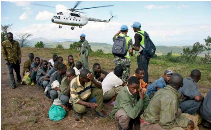
XC's being airlifted by helicopters from Kibuye to Muyinga in Burundi, where the United Nations Operation in Burundi (ONUB) started an operation consisting of deploying XC's to provinces to start their new police training. 11 May 2005.