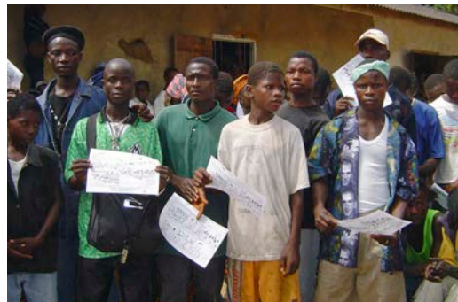
Liberians United for Reconciliation and Democracy combatants with UN cartoon flyers on disarmament, demobilization, rehabilitation, and reintegration (DDRR) in Bopolu, Gbarpolu County, where UNMIL's DDRR programme team visited to inform XCs about its programme. 7 February 2004.

Demobilization, reinsertion, and reintegration are not distinct phases, but rather a continuum of transition from military to productive civilian life. Most often, programmes implement them by considering time and space to accommodate the size of the groups, as a single massive demobilization effort could destabilize the country. During each of these processes, the XCs have different needs and require different support measures. Experience demonstrates that DDR practitioners should think of it as a single, continuous process. Planners must connect and coordinate all sets of activities to increase the chance of a successful outcome. Not everything will happen at once. DDR operations have too often begun as fragmented, uncoordinated efforts with good intentions, and perhaps even short-term successes, before ultimately ending in failure.