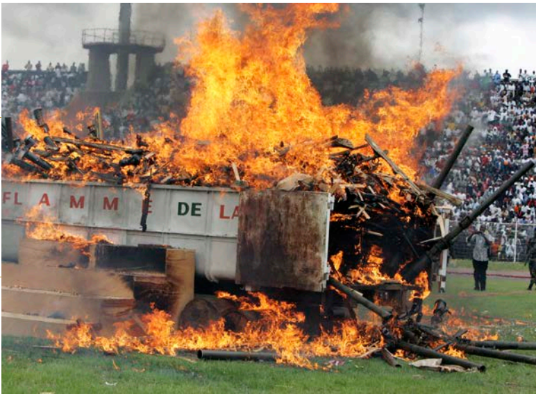
Arms are destroyed by fire during the "Flame of Peace" ceremony to signify the beginning of the country's disarmament and reconciliation process in Bouake, Côte d'Ivoire. 30 July 2007.