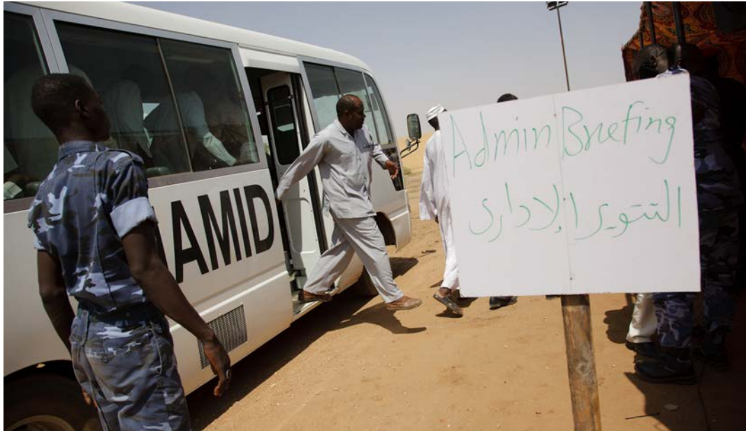
More than 400 XCs from both sides of the long-running Darfur conflict arrived on 4 July 2011 to take part in the disarmament and reintegration exercise run by UNAMID and the North Sudan DDR Commission. 4 July 2011.

Generally, past reintegration programmes have had little in common with development policies despite the fact that reintegration should eventually convert to development efforts. Reintegration strategies occurring in the immediate post-conflict environment must take into account many constraints foreign to development and achieve objectives of little developmental value. However, interdependence is needed to ensure stability of the process. Reintegration programmes will remain unstable unless the subsequent development stage strengthens them. Planners usually develop autonomous reintegration programmes and wait to incorporate development features later on. The best option, however, is to start integrating the most fundamental aspects of development policies into DDRPs from the beginning. This forward linkage helps avoid the urgency trap and aids a smooth transition to development.