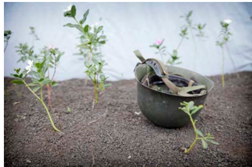
A helmet of the Armed Forces of the Democratic Republic of the Congo (FARDC) in a demobilization transit camp. 20 May 2014.

“Demobilization is the formal and controlled discharge of active combatants from armed forces or other armed groups. The first stage of demobilization may extend from the processing of individual combatants in temporary centers to the massing of troops in camps designated for this purpose (cantonment sites, encampments, assembly areas or barracks). The second stage of demobilization encompasses the support package provided to the demobilized, which is called reinsertion.” 3