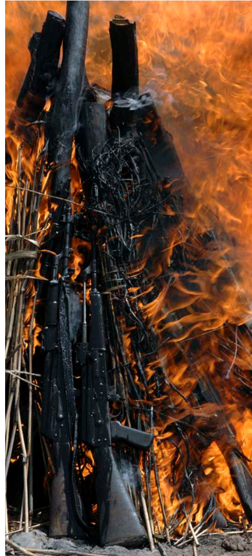
A stockpile of AK-47 rifles of the members of the Sudan People's Liberation Army burns at the launch of the DDRP in southern Sudan by the United Nations Mission in Sudan (UNMIS). 10 June 2009.

XC's have been schooled in and practiced violence for a living. Membership in an armed force — whether regular or irregular — can provide individuals with a livelihood, social status, identity, support network, and security. After demobilizing, XC's lose the things that membership in the force represented to them. They also have experience participating in a cooperative organizational structure to carry out violent activities. Easy access to weapons is the norm in countries recently engaged in a civil conflict. If they are unable to meet their basic needs, they may engage in criminal or political violence. They may re-arm themselves in small groups to participate in actions such as roadblocks or kidnapping to reinforce their demands. They may become involved in armed disputes with their former rivals or get involved with other armed groups or organized crime, destabilizing the peace process.