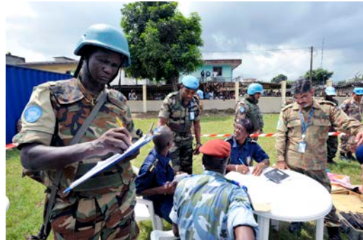
Officers of the United Nations Operation in Côte d'Ivoire (UNOCI) conduct a DDR operation with XCs in the Abobo area of Abidjan. 1 February 2012.

The conditions around DDR operations have increased in complexity as new threats and circumstances emerge. While DDR Programmes (DDRP) vary according to the context, it is important to note that DDR does not function in a vacuum — it functions as part of a larger peace operation that includes other socioeconomic, political, and security reforms. Thus, a DDRP must take into account these other issues, and DDR practitioners must plan, design, and implement programmes within a wider recovery and development framework.