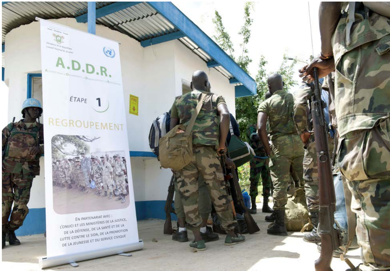
The Authority for Disarmament, Demobilization, and Reintegration (ADDR) begins demobilization processing on a site at Anyama, outside Abidjan, rehabilitated by the United Nations Mission in Liberia (UNMIL) and its partners. XCs line up to turn in their weapons, receive demobilization cards, and begin reintegration. 25 October 2012.

"In many respects, the range of activities that fall under the heading of 'disarmament, demobilization and reintegration (DDR)' is as wide as the global scope of the United Nations system itself. In the early days after a cessation of hostilities, DDR can serve as a vital confidence-building measure. DDR features prominently in the mandates of United Nations peacekeeping operations. In the last few years, we have also seen that DDR is just as crucial for peacebuilding, as reflected by the increasing references to DDR tasks in integrated peacebuilding missions.