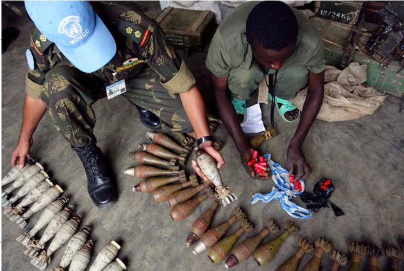
A United Nations peacekeeper from the Indian battalion of the United Nations Organization Mission in the Democratic Republic of the Congo (MONUC) takes stock of weapons and ammunition collected during the demobilization process in Matembo, North Kivu, in the Democratic Republic of the Congo. 8 November 2006.

the factions viewed the concept of disarmament the same as surrendering and could accept it. Those situations required a new language of putting weapons beyond use in order for disarmament to proceed. The fact remains that over time, disarmament must occur, be it through a DDRP or a subsequent SALW programme. The same is true for demobilization, which can be done in a mobile or in situ manner. In a mobile demobilization process, the programme goes to the people. In the in situ manner, the XCs go to an assembly area, concentration area, or holding area for processing. In other circumstances, combatants may already be in their chosen communities and DDR (especially reintegration) can take place there along with the other returning refugees, IDPs, and stayees. This all depends on the context of the conflict.