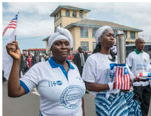
Liberians celebrate the tenth anniversary of the CPA, signed in Accra on 18 August 2003, which ended their country's 14-year civil war. 19 August 2013.

Formerly opposed communities may maintain their tensions and distrust in the aftermath of civil conflicts. In light of this, the overriding goal of the peace process is to encourage formerly hostile communities to communicate and bargain with each other within the framework of agreed-upon procedures of a CPA. The CPA outlines procedures that can help channel competing interests and policy differences into peaceful forms of competition and collaboration. DDR practitioners must make these peaceful channels more attractive as the means for achieving group and individual interests than the alternative of taking up arms. Some recent conflicts have lacked peace agreements. In those cases, the DDR process aims to provide an alternative to continued conflict and violence while working towards an eventual peace agreement.