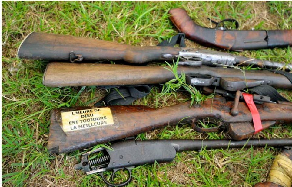
Relinquished firearms are laid on the ground as officers of UNOCI conduct a DDR operation with XCs in the Abobo area of Abidjan. 1 February 2012.

In the transition period following a civil conflict, various actors place differing priorities on programme objectives. Actors include governments, former warring factions, non-governmental organizations (NGOs), international organizations such as United Nations agencies, and donors. DDRP objectives may be social, economic, political, military, and/or fiscal. Social and economic objectives might include equitable and sustainable development. Political objectives include democratization and stability. Military objectives may include a smaller and more affordable armed force that meets the new security needs of the country. Fiscal objectives include debt and deficit reduction and improving the balance of payments.