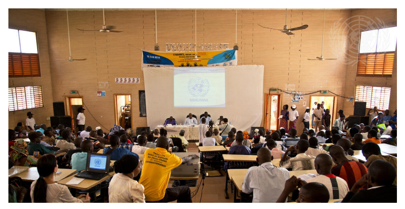
Representatives of the civilian, military, and police components of the United Nations Multidimensional Integrated Stabilization Mission in Mali (MINUSMA) held the first of several meetings, focusing on the theme of peace and reconciliation, with students of the University of Bamako and explained the mandate of the United Nations mission. A wide view of the setting during the presentation by MINUSMA to university students. 18 April 2014.

"[...] to maintain international peace and security, and to that end: to take effective collective measures for the prevention and removal of threats to the peace, and for the suppression of acts of aggression or other breaches of the peace, and to bring about by peaceful means, and in conformity with the principles of justice and international law, adjustment or settlement of international disputes or situations which might lead to a breach of the peace".5