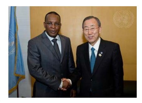
Secretary-General Ban Ki-moon (right) meets with General Sékouba Konaté, African Union High Representative for the African Standby Force, in Addis Ababa, Ethiopia. 30 January 2012.

A centrally managed roster of civilian specialists will also be available in mission administration, human rights, humanitarian operations, governance, and disarmament, demobilization, and reintegration (DDR).