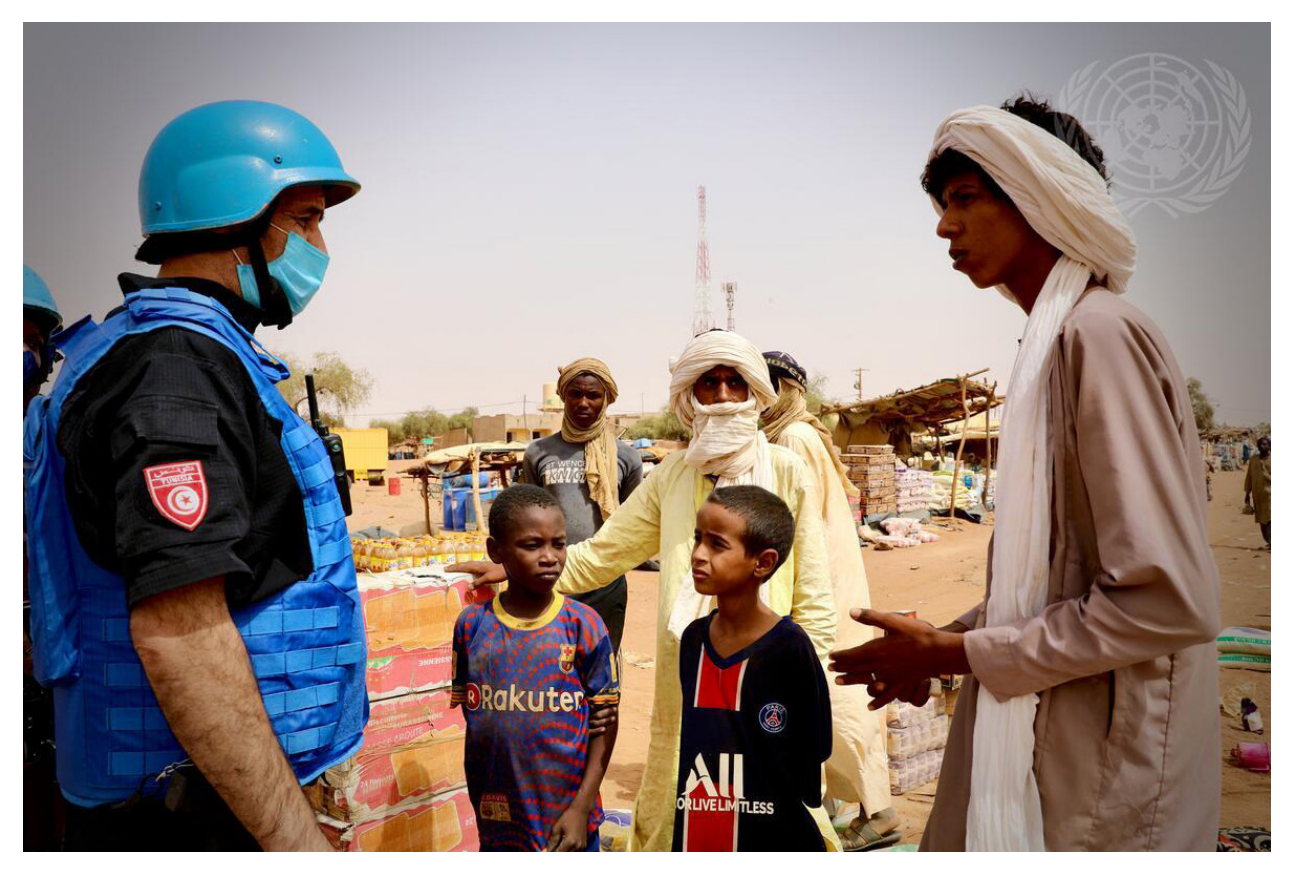
The region of Menaka, located 1,500 km from Bamako in the northeast of Mali, has been experiencing increasing insecurity as a result of attacks by terrorist groups and other armed groups. United Nations Police serving with the United Nations Stabilization Mission in Mali (MINUSMA) carry out daily patrols in order to secure the civilian population. 13 June 2021.