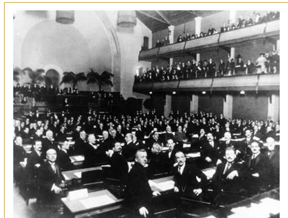
The League of Nations at its opening session in Geneva. 15 November 1920.

While the League of Nations achieved some successes during its period of operation, including addressing refugee crises and improving international labour conditions, it had structural weaknesses that ultimately limited its effectiveness as an international organization. One such weakness was difficulty enforcing its resolutions. The League did not have an armed force of its own but rather depended on the major powers to back up its mandates, which they were often reluctant to do. Similarly, economic sanctions imposed by the League had little impact on targeted countries, as those countries could simply trade with non-members. Despite its goal of solving international conflicts through diplomacy, the League was unable to prevent the Second World War. The League of Nations held its final meeting in Geneva on 18 April 1946. 19