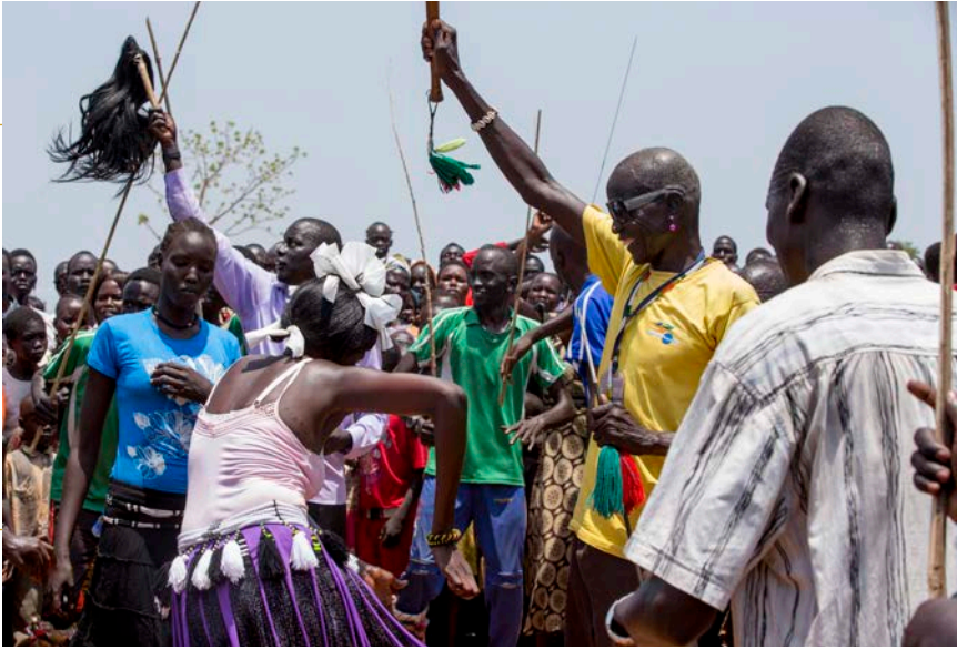
Residents of a Protection of Civilians (POC) site run by the United Nations Mission in the Republic of South Sudan (UNMISS) perform at a special cultural event last Friday, in Juba. 27 March 2015.