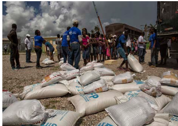
The World Food Programme (WFP) and their local partner, Fondation pour le Développement et L'encadrement de la Famille Haitienne (Fondefh), distribute food to residents of Torbek, a commune on the outskirts of Les Cayes that was heavily damaged by Hurricane Matthew. 13 October 2016.

Aid delivery during conflict may also have unintended consequences. Local warlords and/or parties in a conflict may target aid delivery. Theft of aid is common, including at checkpoints (e.g. paying access to the area), at warehouses during the night, or simply stolen from the local population as a “tax” or protection fee. The stolen resources may be sold and the money used to buy weapons. In this way, aid can perpetuate a conflict. Understanding the context of a conflict is not easy. Examining all stakeholders and actors can help provide an understanding of the context. Who gains and who loses? Who has the power? How are the different actors related to each other? The warring factions will not view the aid and its delivery as totally neutral. Aid agencies must identify strategies on how to deter theft in their aid programmes. What works in one area might not be effective in another. There is no “one size fits all” solution.