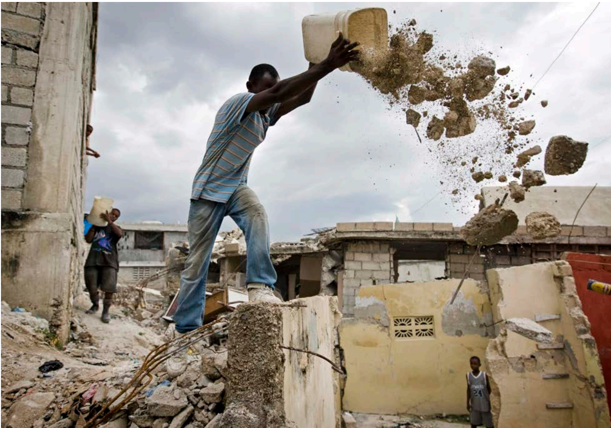
Workers of the United Nations Stabilization Mission in Haiti (MINUSTAH) and Jenkins and Penn Haitian Relief Organization (J/P HRO) remove street rubble in Delmas 32, Port au Prince, following an earthquake in Haiti. 12 August 2010.