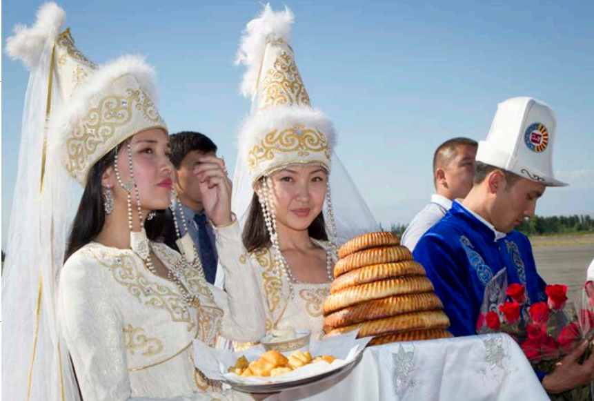
Cultural representatives present Secretary-General Ban Ki-moon traditional cuisine on his departure from Osh, Kyrgyzstan. 11 June 2015.

There are many other examples of how aid delivery can negatively affect the environment and its population. The intentions of aid agencies and workers may be noble, with humanity as a basic principle. Whenever organizations and workers provide aid, they must ensure their actions do not create an unsustainable environment, disrupt the affected population, or create dependency.