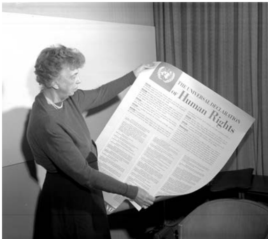
Mrs. Eleanor Roosevelt of the United States holding a Declaration of Human Rights poster in English. 1 November 1949.

In 1998, 120 States adopted the Rome Statute, the legal basis for establishing the permanent International Criminal Court (ICC). The ICC is an independent international organization based in The Hague, and it is not part of the United Nations system. The ICC has heard several cases, and some remain ongoing. 44