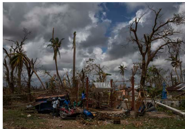
Residents of the commune of Torbek on the outskirts of Haiti's western city, Les Cayes, struggle to pick up the pieces after the devastating passage of Hurricane Matthew. 13 October 2010.

Comment: Disasters are often described as a result of the combination of: the exposure to a hazard; the conditions of vulnerability that are present; and insufficient capacity or measures to reduce or cope with the potential negative consequences. Disaster impacts may include loss of life, injury, disease and other negative effects on human physical, mental and social well-being, together with damage to property, destruction