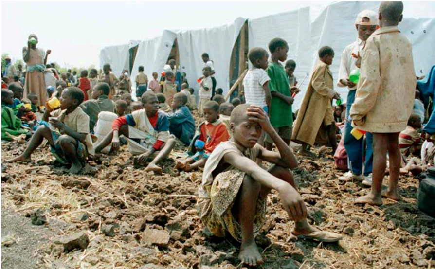
Rwandan children who lost their parents resting at Ndosha camp in Goma. 25 July 1994.