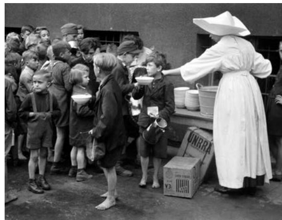
A Sister of Charity distributes UNRRA food in Belgium. 1 January 1946.

Swiss businessman Henry Dunant is considered to be the father of modern humanitarian action and organizations. Dunant was a leading force behind the First Geneva Convention of 1864 and the founding of the International Committee of the Red Cross (ICRC). In his 1862 book Un souvenir de Solferino , 14 Dunant described the atrocities he witnessed at the 1859 Battle of Solferino during the Second Italian War of Independence, including thousands of killed and wounded soldiers. In the book, he developed